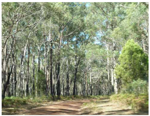
Cobboboonee National Park